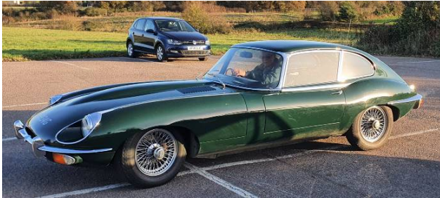
James Portway's Jaguar E-Type 2+2