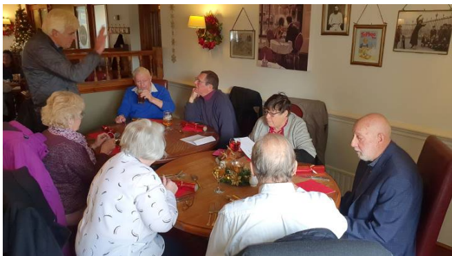
36 Diners, can you recognise yourselves and other diners?